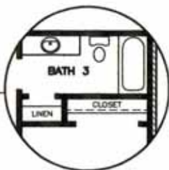
OPTIONAL LINEN LOCATION