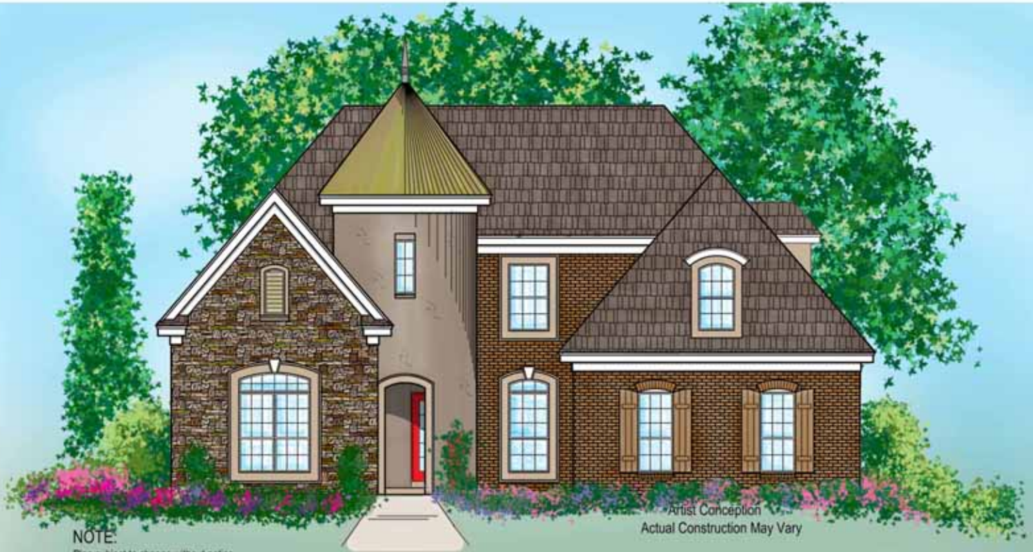
Artist Conception Actual Construction May Vary

NOTE: Plan subject to change without notice. Construction may vary from artwork. Room Dimensions are finished sizes.