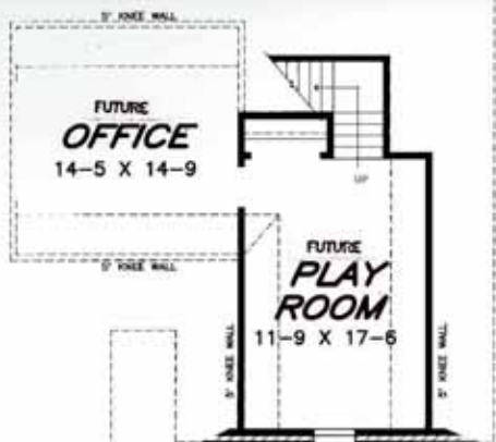
FUTURE SECOND FLOOR PLAN